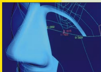
INSPECTION OF TANGENCY OF SURFACE EDGES