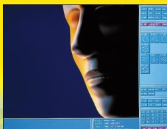
EVALUATION OF SURFACE QUALITY WITH HIGH END SHADING TECHNOLOGY

Good product design is an art. Or at least it was 20 years ago, when a leading Swedish manufacturer of protective clothing needed a model to produce masks and had to hire a sculptor for the job.