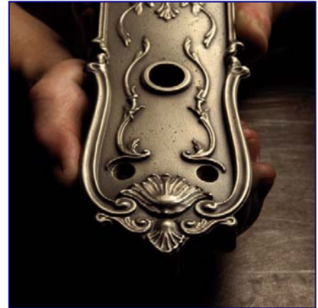
“Chateau” entry handle set detail.

When Jay saw the detailed, complex shapes of the leaves and vines in the designs that had been selected from the sketches; he realized that they could not make these models & computer renderings using their existing tools within a reasonable amount of time. The technical difficulties of using traditional CAD tools to model highly detailed, organic shapes with old world craftsmanship, combined with the need for flexibility to modify the designs to accommodate different internal locking mechanisms, threatened to bring the project to a standstill.