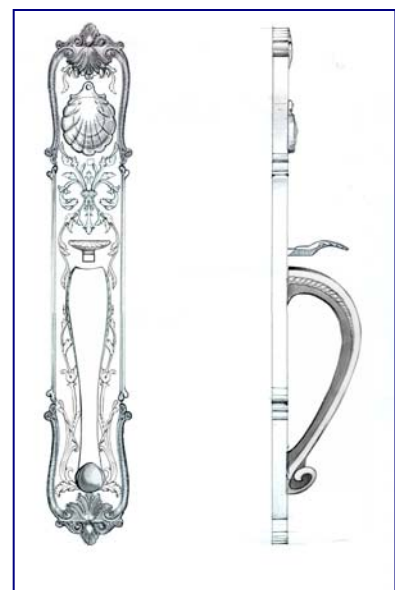
Sketch of entry handle set.

Working from the sketches, Black and Decker – HHI’s typical process at this point would have been to create simple NURBS models of the designs using Alias® Studio, and then generate computer renderings with enough shading and lighting to be