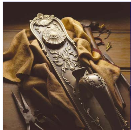
“Chateau” entry handle set.

In an era where what is old is new, Black & Decker - HHI and Baldwin set out to create an exclusive line of door hardware that would evoke the artistic beauty and elegance epitomized in France during the 18 th century. Their goal was to bring “old world craftsmanship”, including the imperfections inherent in handcrafted design, into the modern machine-age of perfection, precision, and fast time-to-market. When they realized that it would be impossible to produce the products they envisioned using their traditional CAD tools alone, they turned to the FreeForm Modeling Plus system to help them bring the “Chateau” and “Craftsman” lines of Baldwin Archetypes to market.